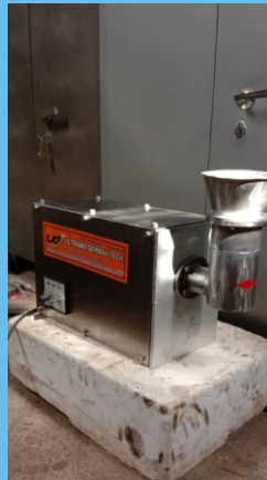
BASKET EXTRUDER LAB